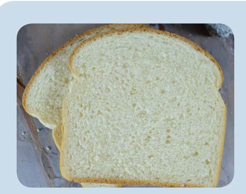
Figure 3: White pan bread made using 100% HealthSense™ high fiber wheat flour.

between refined common wheat flour and HealthSense™ flour for absorption, stability, and mixing tolerance index. Despite these rheological differences, studies done at Bay State Milling's Rothwell GrainEssentials Center have shown that HealthSense™ flour is fully functional in various applications.