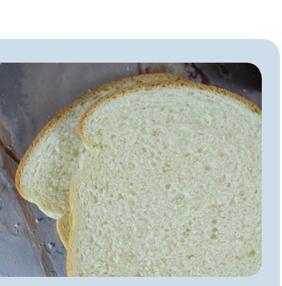
Figure 1: White pan bread made using 100% HealthSense™ high fiber wheat flour.